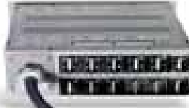
ACTOR 716 with POWER CABLE